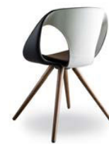
907.77 hide and leather